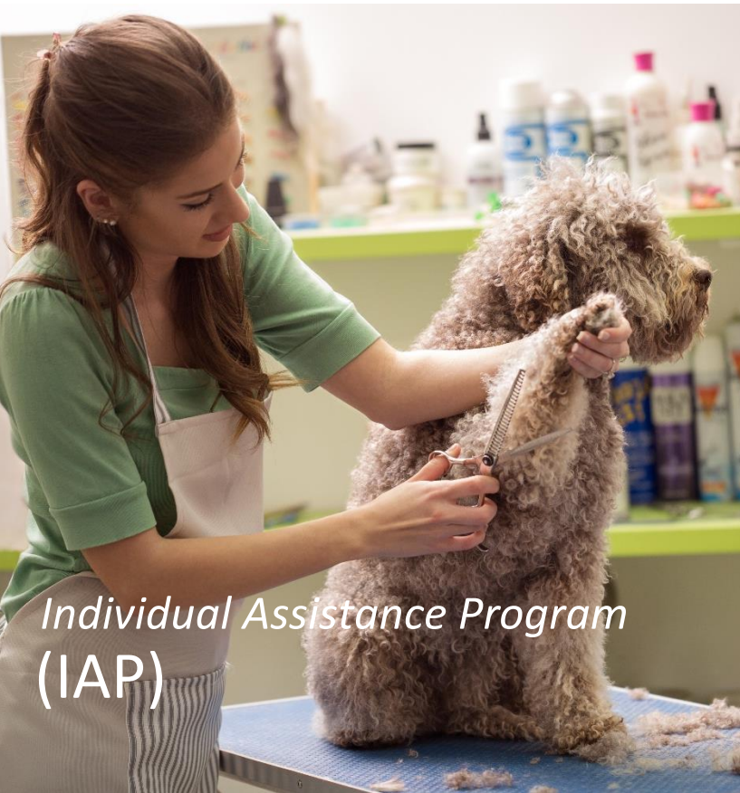
Individual Assistance Program (IAP)